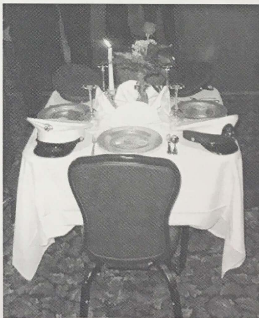
One lone table stands unused, in honor of those who gave the ultimate sacrifice to our country.